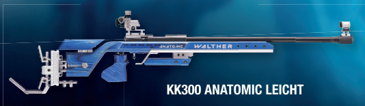
KK300 ANATOMIC LEICHT