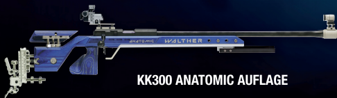
KK300 ANATOMIC AUFLAGE